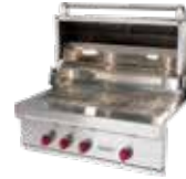
36" Outdoor Gas Grill REBATE $700