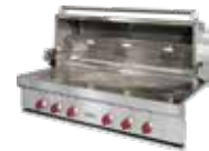
54" Outdoor Gas Grill REBATE $900