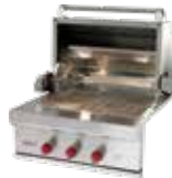
30" Outdoor Gas Grill REBATE $600