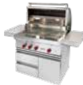
30" 36" 42" Grill Cart REBATE $300