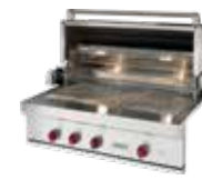
42" Outdoor Gas Grill REBATE $800